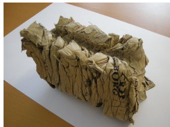
Small and compact briquette